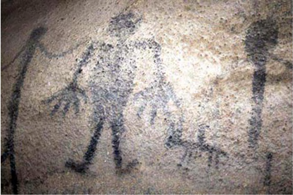
Figure 8. Figure with L-shaped feet at Valle Seco.