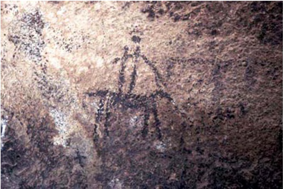
Figure 2. Man on horseback at Piedras Grandes site.