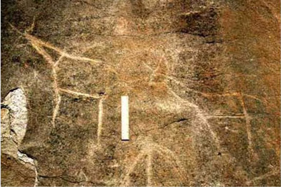
Figure 14. Panel with unusual animal elements at Del Mar Heights, San Diego County.