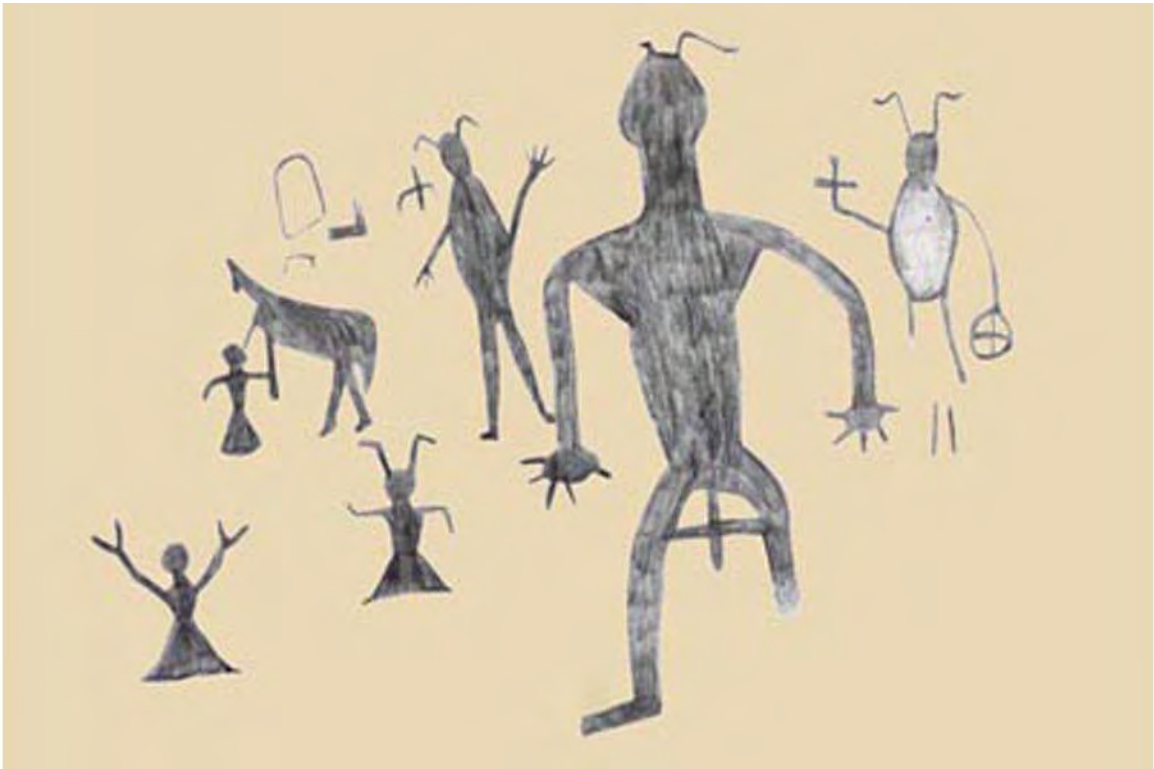
Figure 9. Possible Catholic elements at San José, near Tecate.