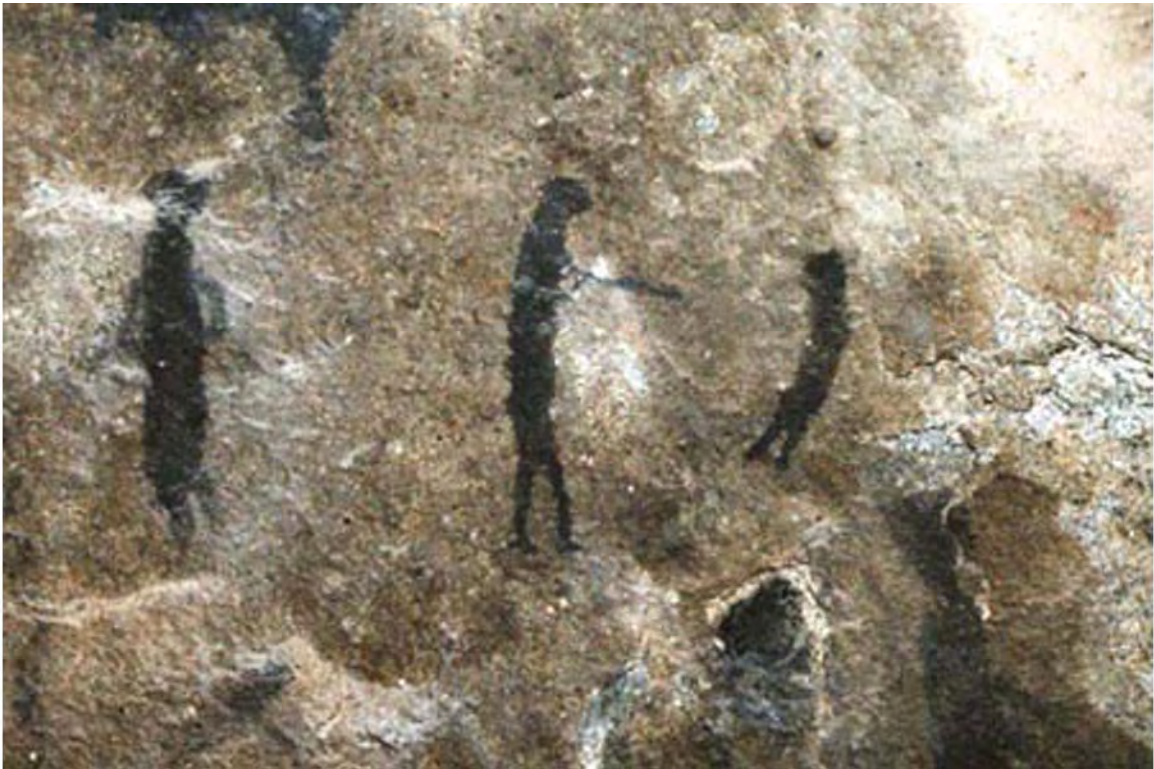
Figure 7. Apparent scene of a man with a rifle at Valle Seco.