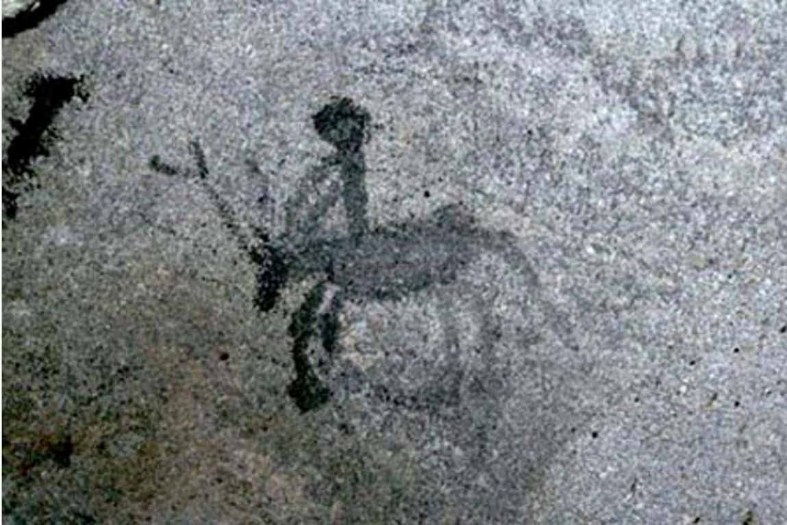
Figure 5. Second equestrian figure at Valle Seco.

(Figure 6). One, with rounded head, pointed ears and a short tail, appears to be a bobcat. The notion of riding an animal like a horse is an introduced concept that here may have been adapted to some ritual context. The same panel has a figure pointing a straight stick-like object that appears to represent a man shooting or threatening a second individual with a rifle (Figure 7). This Valle Seco panel is an intriguing collection of elements that appear to represent some sort of scene, but the exact meaning remains unknown.