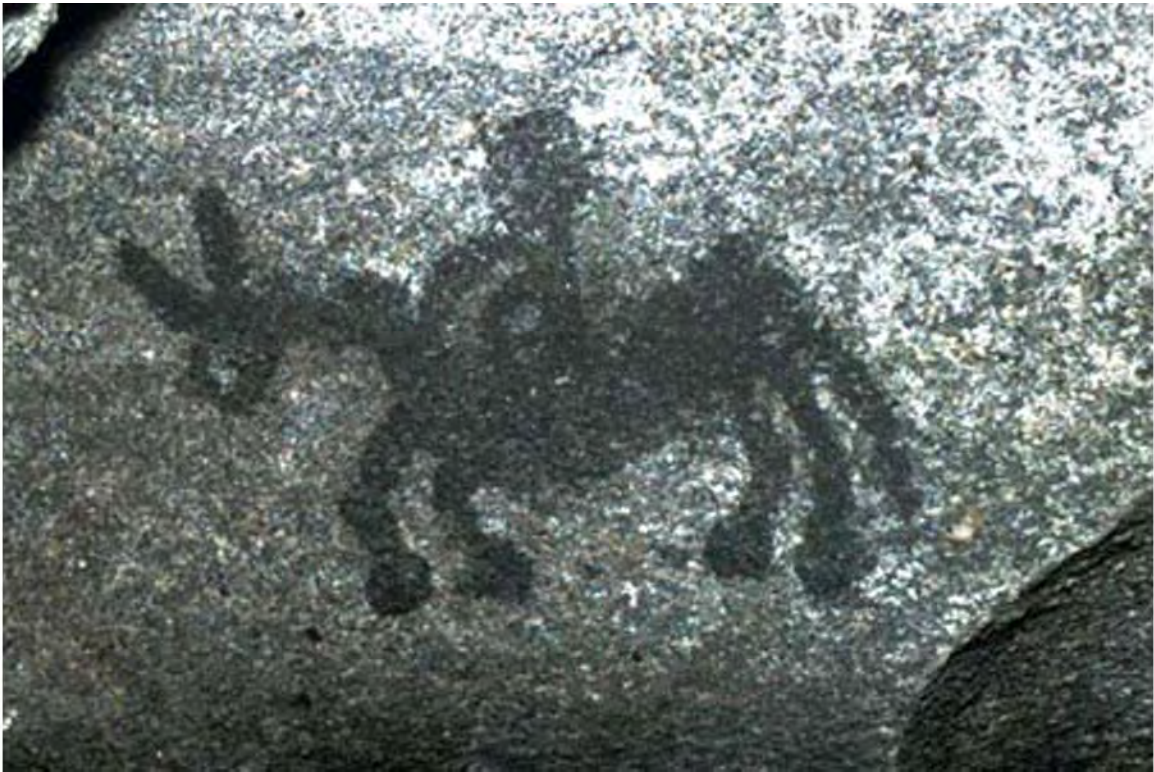
Figure 4. Man riding a mule at Valle Seco.