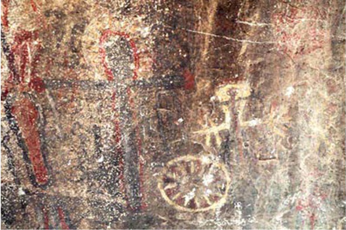
Figure 11. Large cross in the Guadalupe panel.