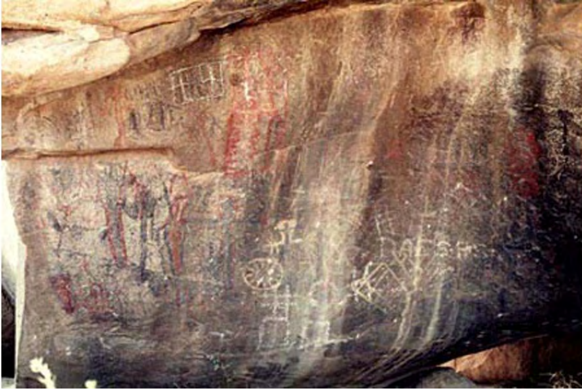
Figure 10. Former rock art panel in the village of Guadalupe.