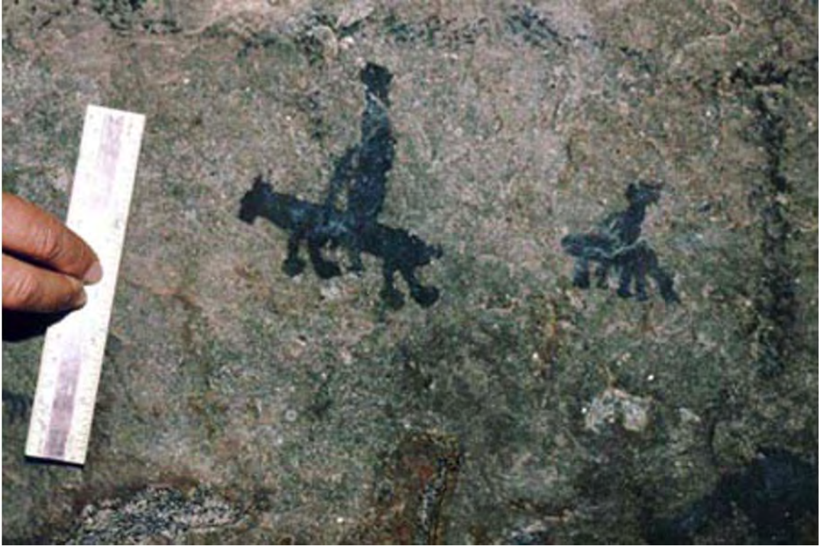
Figure 6. Two figures mounted on animals at Valle Seco.