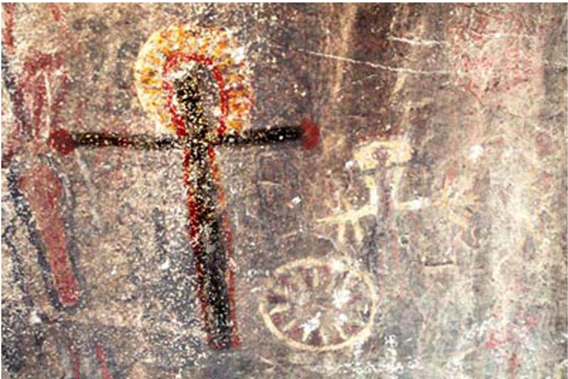
Figure 12. Another view of the Guadalupe cross.