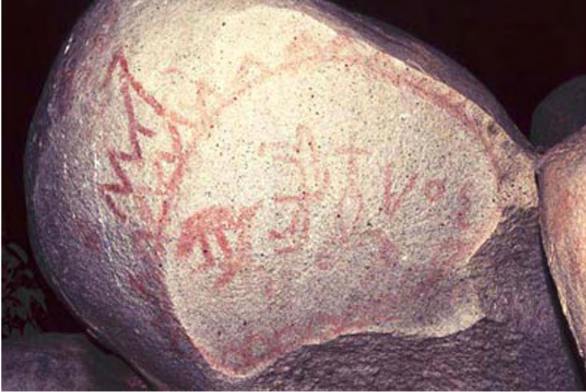
Figure 13. Boulder with historic elements at Mission Trails Park, San Diego.

elements is one design resembling a schematic cow's head (somewhat like a cattle brand) and the possible representation of a bishop's miter. Given the close proximity of the mission, it is tempting to associate this painting with the Spanish occupation of San Diego beginning in 1769, or with the Indian uprising that destroyed the mission in 1776.