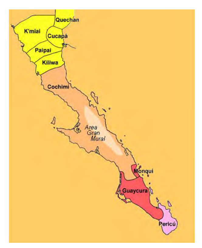
Figure 1. Ethnolinguistic map of the Baja California peninsula.

ceremonies, disposal of personal property, use of names and genealogies, human hair capes, anthropomorphic images, impersonation of the dead in ceremonies and ideas about the afterworld. Also noteworthy are the differences between the behavior that was considered appropriate for relatives of the deceased and the behavior expected of non-relatives and enemies.