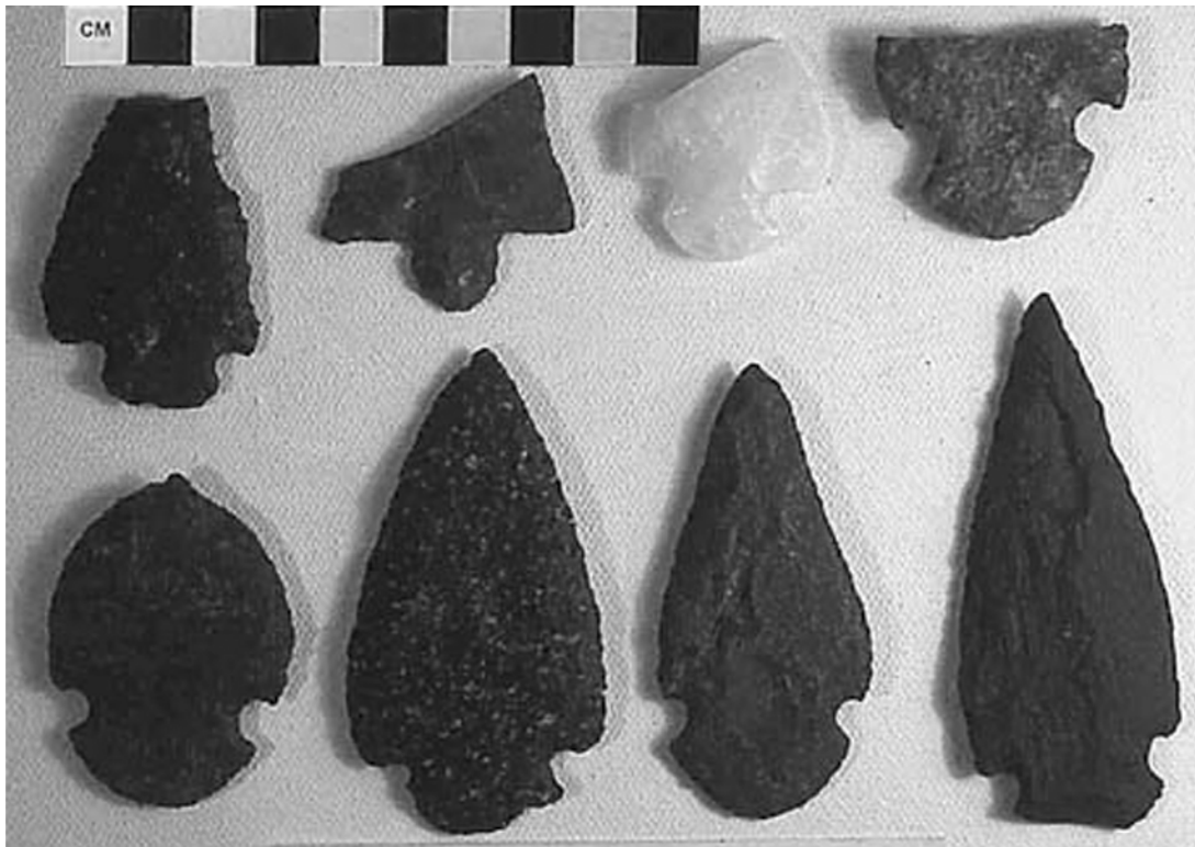
Figure 10. Corner-notched projectile points.

point, and a basalt possible wide-stemmed point base from a private collection.