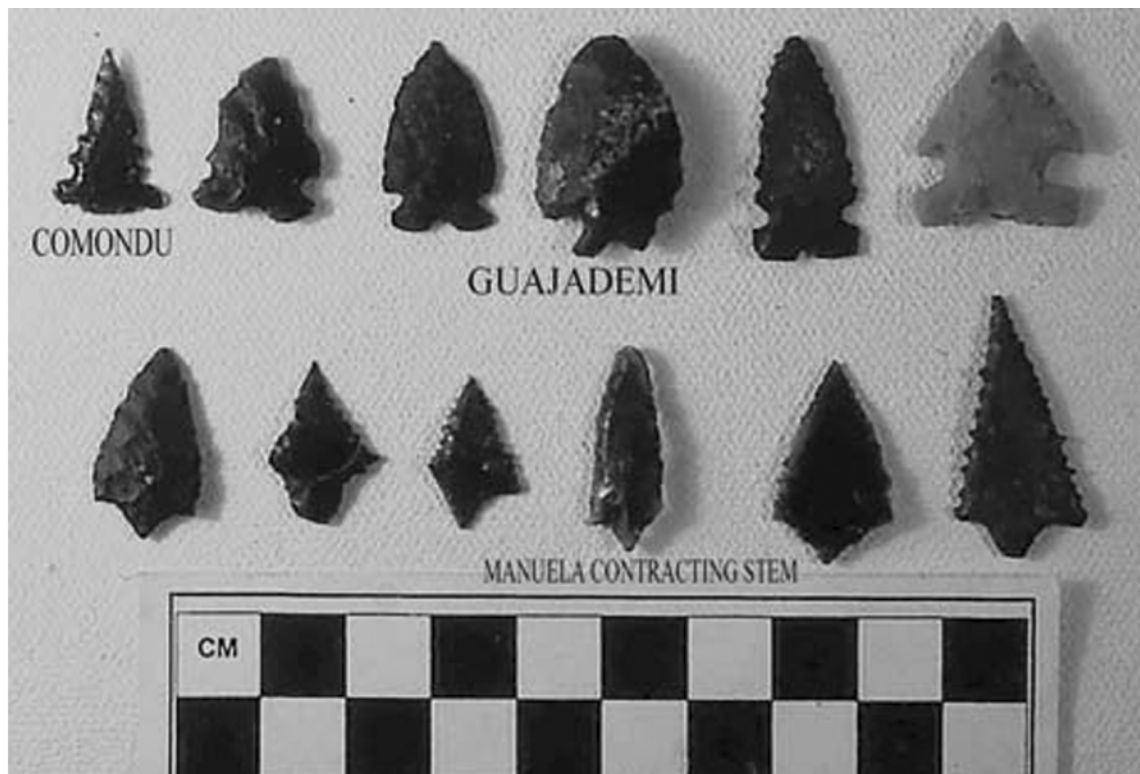
Figure 9. Comondú, Guajademi and Manuela contracting-stem projectile points.