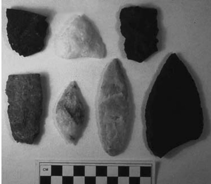
Figure 7. Bifaces,

quartz. However, a vast majority of broken early-stage bifaces are obsidian, the remainder being aphanitic volcanic, cryptocrystalline silica and quartz.