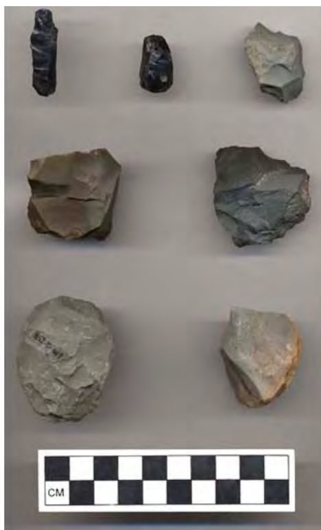
Figure 3. Cores.

that varied from a large 40-cm-long, 25-kg boulder multidirectional core to pebbles, large flakes and finished or near-finished tools such as bifaces and projectile points (Ritter 1999:93-94). Small bipolar cores of obsidian (see Figure 3, top left and center) are frequent around Laguna Guerrero Negro and the southern reaches of Laguna Manuela. Because of its superior flaking quality and ability to form a very sharp edge, obsidian was generally the more favored material for many of the flaked stone artifacts, especially around the north shore of Laguna Ojo de Liebre and the east shore of Laguna Guerrero Negro. Furthermore, as related in greater detail below, this material was extensively used and frequently reused down to the smallest flake.