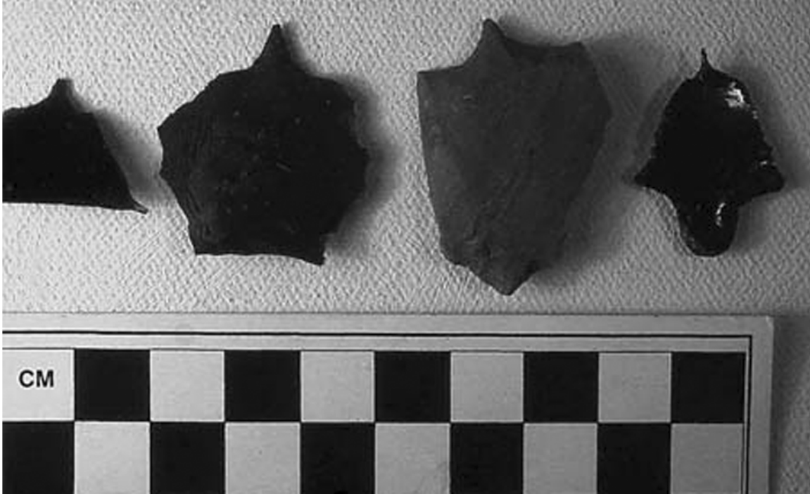
Figure 6. Perforators/gravers.