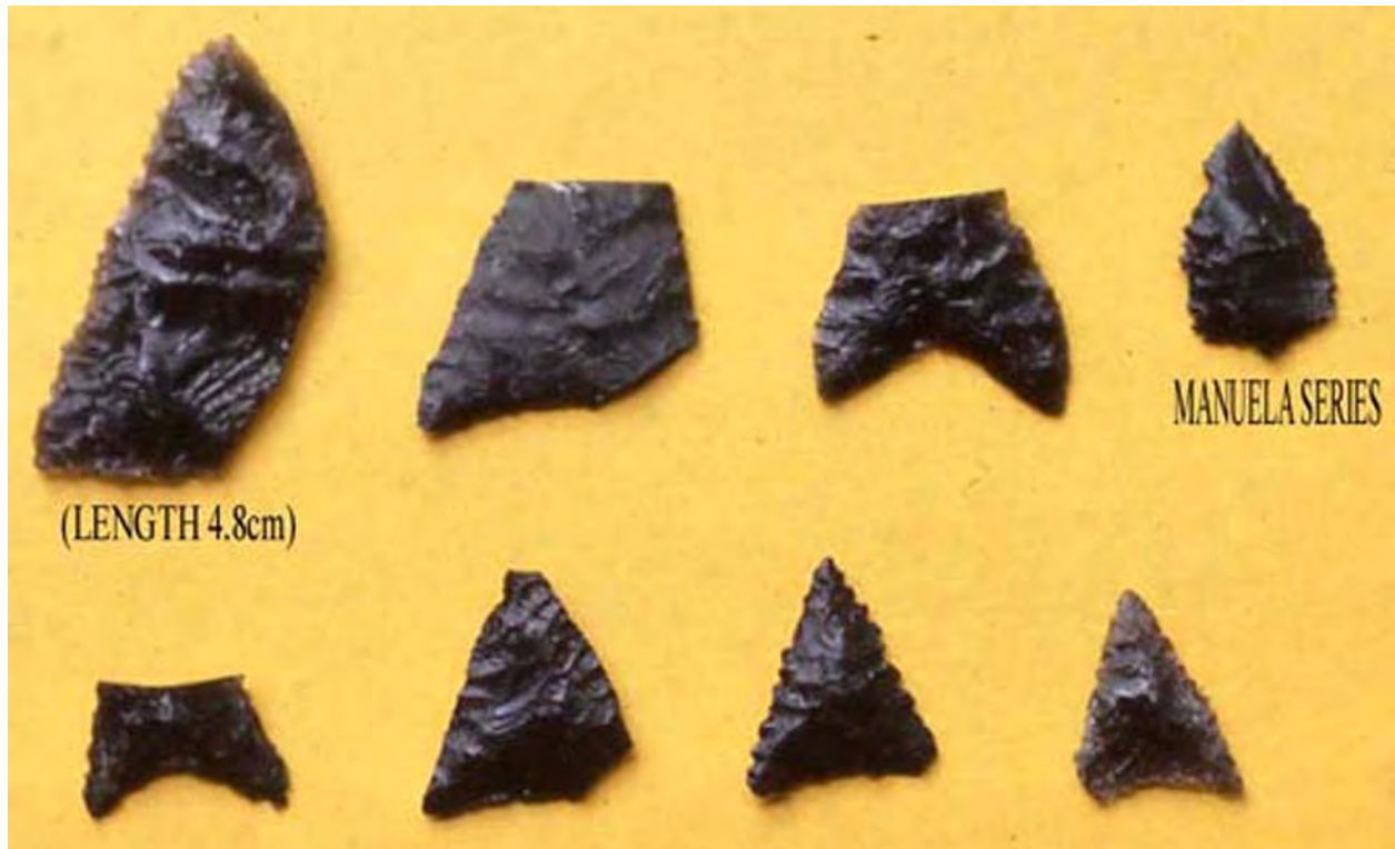
Figure 8. Guerrero Negro series and Manuela series projectile points.