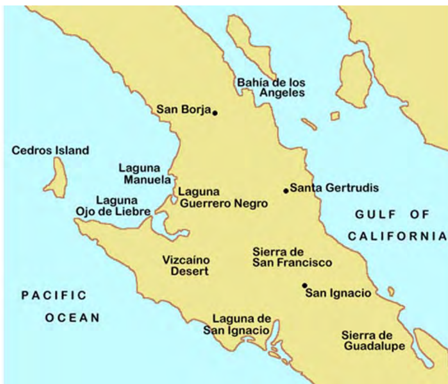
Figure 1. The central Baja California peninsula.

Vegetation along the coast includes a coastal sand dune community and a coastal salt marsh (Wiggins 1980:24) (Figure 2). While a broad suite of terrestrial fauna was present in the area, ranging from rodents to antelope and deer (cf. Galina et al. 1991; Orr 1960), the locality's principal attraction for Indians was the rich marine fauna (cf. Henderson 1972; Hubbs 1960; Nelson 1919; Scammon 1970), including fish, mollusks, crustaceans, sea mammals and sea turtles.