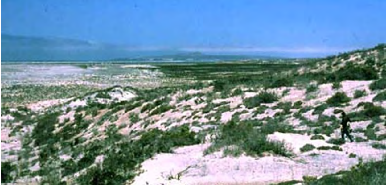
Figure 2. Laguna Manuela.

conducted at all sites. At most sites, a grab sample of other flaked stone artifacts has occurred, along with extensive obsidian artifact sampling. Surface collection transects of flaked stone (and other remains) have been conducted across areas where the artifact concentrations have been the most dense and extensive, or they were done at random from a central point. At some Laguna Guerrero Negro and Laguna Manuela sites, purposefully placed circular excavation units were screened (850 micron mesh), primarily to obtain faunal remains but also to secure other cultural items. At several sites in the Laguna Guerrero Negro vicinity arbitrary or systematic spaced excavation units were sorted, utilizing 3-mm screens. Almost all of the inter-dune sites documented exhibit shallow, sandy deposits, usually only about 10-20 cm deep, with extensive movement of dune sands on and off the cultural remains. Considering the above factors, the overall observation and collection procedures and analyses are believed to provide a reasonably accurate basis for understanding the flaked stone assemblages present along these shores.