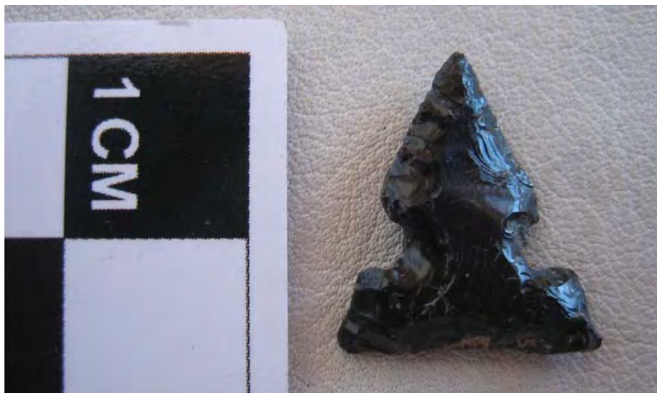
Figure 3. Small side-notched obsidian projectile point.

This was partly pragmatic: during the formative years of agricultural development, occasional crop failures necessitated that Indian neophytes revert to traditional hunting and gathering practices to keep food on the table. But even in later years, when food production was well established, it appears some missionaries granted regular furloughs to neophytes to participate in acorn harvests or to visit their homelands and presumably gather wild foods (Guest 1983:45; Kelsey 1985:505; Timbrook et al. 1993:133-134). As John Johnson recently wrote,