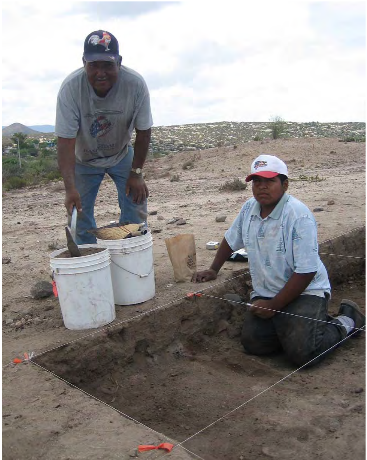
Figure 2. Excavation.