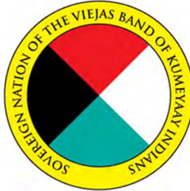
Figure 1. Color-direction symbolism in the emblem of the Sovereign Nation of the Viejas Band of Kumeyaay Indians.