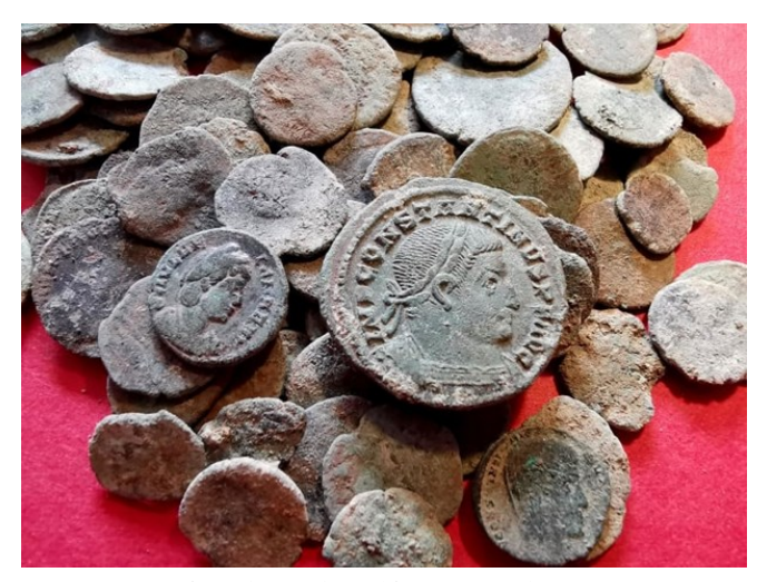
Roman coins found.

To find out more about this amazing discovery, check out <u>Hungry Badger</u>.