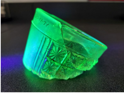
Uranium glass under florescent light (left) and UV light (right)

I discovered a fragment of a pressed glass vase in an odd color, sort of a yellow-green. I had my suspicions and, after testing with a UV light, I was correct! We had a piece of uranium glass, the first we know of in our collections.