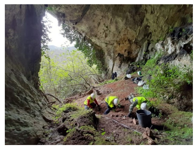
La Cuesta Cave, Spain.

A collection of gold coins from the rule of Constantine had been discovered nearby around 85 years ago. Some suggest that refugees fleeing conflict in the region may have stashed the coins for safe keeping.