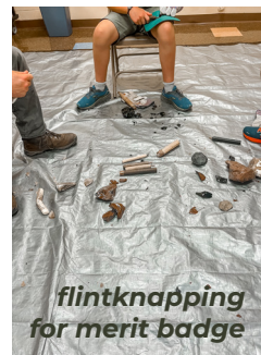
flintknapping for merit badge

Over the summer, we restarted our Boy Scout merit badge program. We hosted Troop 226 and Pack 734 here at the Center and certified two merit badge counsellors for Archaeology and one counsellor for Geology. We look forward to hosting many more troops!